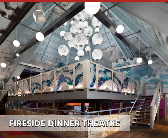
FIRESIDE DINNER THEATRE