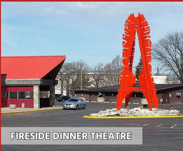
FIRESIDE DINNER THEATRE